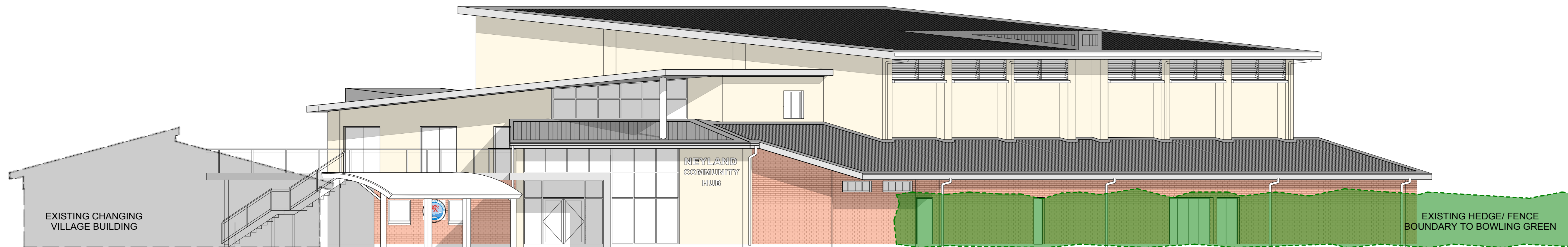
01. PROPOSED WEST ELEVATION